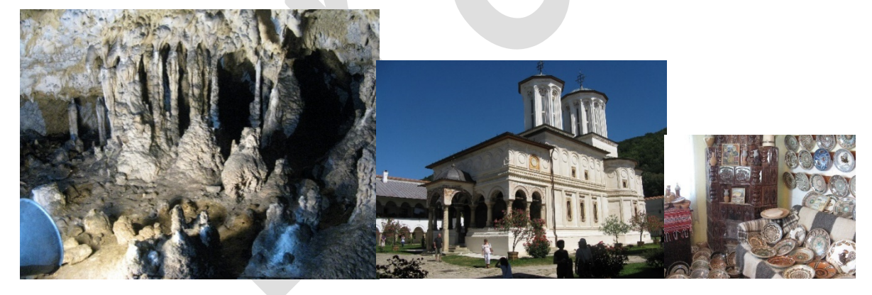
17/06 Costesti – Open air museum of Trovanti (alternatively Bistrita gorge, narrowest in Romania) – Craiova – Lunch (optionally visit of Corcova Winery) - Turnu Severin – Crossing border to Serbia – Donji Milanovac (dinner, overnight stay)